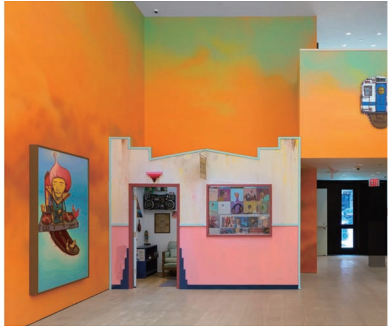
Reference image for the new works - Record Store

Barry McGee and OSGEMEOS "Untitled" 2024 Acrylic and spray paint on wood photo:OSGEMEOS