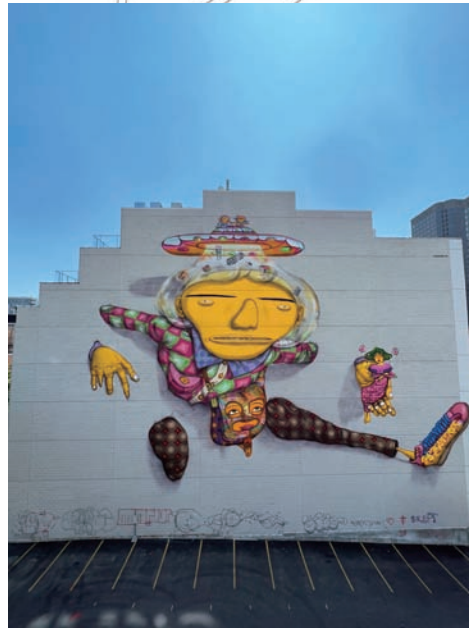
Reference image: OSGEMEOS "Giant" 2022 Mural produced by Festival MURAL in Montreal, Canada

A large wall will be built to show a collaborative work of the artists. It will send a message to people walking on the street.