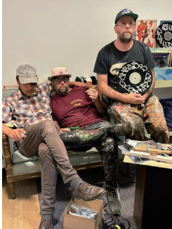
Barry McGee and OSGEMEOS