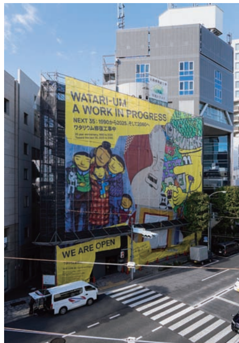
(From left) OSGEMEOS, Barry McGee, SIDE CORE at WATARI-UM. 2024

From September to December in 2024, prior to the exhibition, we made a construction sheet featuring the works of OSGEMEOS, Barry McGee, and SIDE CORE, a Japanese street art group who was holding a solo show at WATARI-UM at that time. While a large repair project was underway, we covered the 20x20-meter façade of the museum building with the sheet. The suddenly appeared big mural gained a lot of attention.