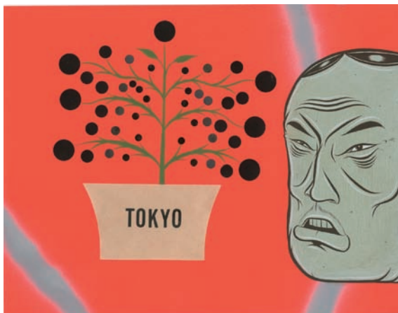
Barry McGee "Untitled" 2023 gouache, aerosol, and vinyl on paper