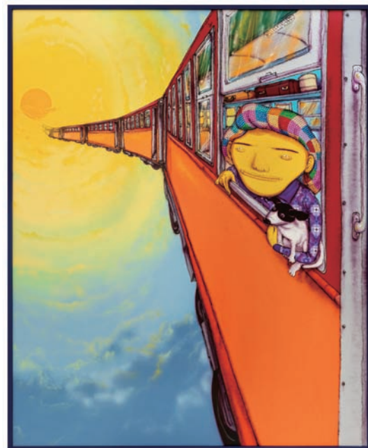
Reference image: OSGEMEOS "A Viagem" 2025 mixed media with sequins on MDF