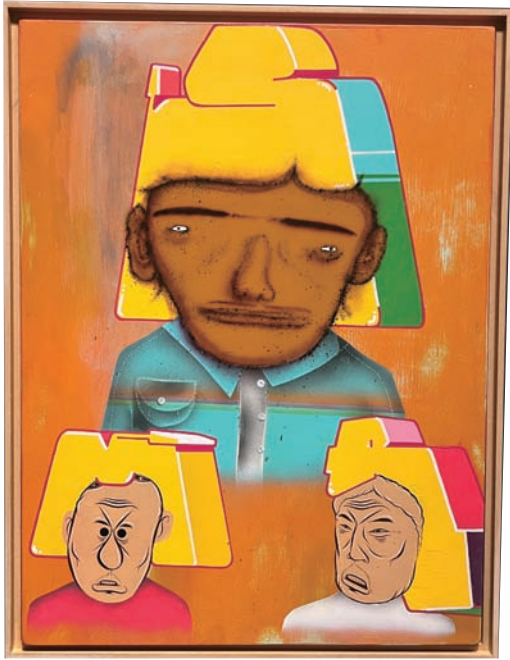
Reference image :

Barry McGee and OSGEMEOS "Untitled" 2024 Acrylic and spray paint on wood