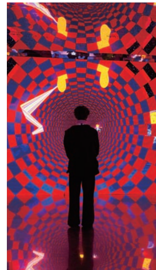
Reference image for the new works : Animation -Design for the wall

The animation room will have four walls covered in LED panels and a mirrored ceiling and floor. Inside the room, the two artists' works will float around in a gravity-free state, creating the illusion of an outer space.